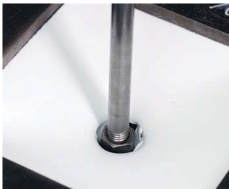
Rigid HDPE perforates when impacted during a puncture test.