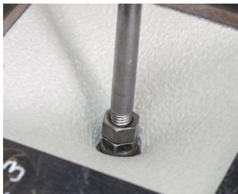
Pliable MiraPLY-H with SeamLOCK™ Technology inherently absorbs impact during a puncture test.